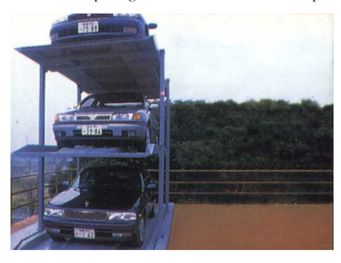
Category 1b: Small above ground with Decks Sunken

Minimum side openings : 50% of perimeter walls