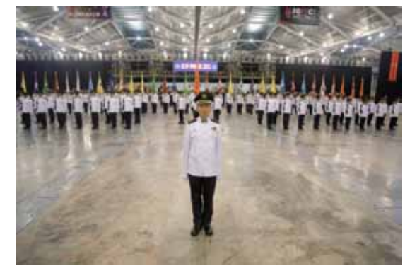
18 The LATEST 5th Generation Light Fire Attack Vehicle