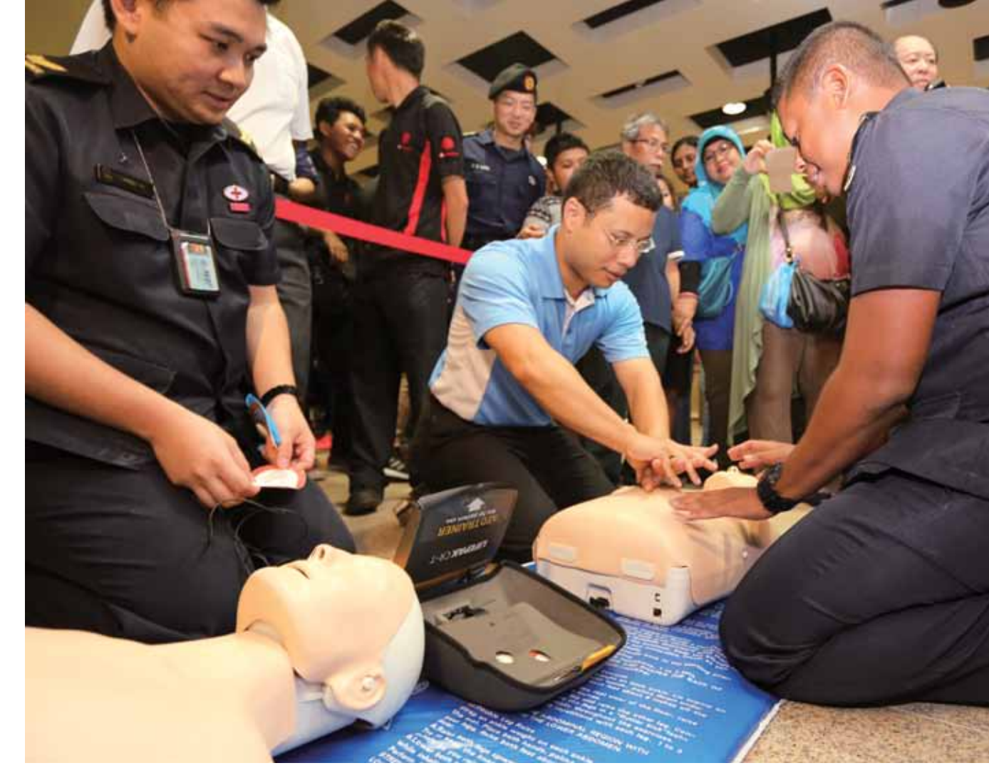
Picture: Mr Desmond Lee, Senior Minister of State for the Ministry of Home Affairs, demonstrating the CPR procedures at the Shelter Open House at Bukit Panjang MRT Station.

Apart from the opportunity to view the MRT Civil Defence shelter facilities, such as the entrance blast door, decontamination chamber, dry toilet system, water distribution points, the shelter command post and use of shelter management areas, close to 10,000 members of the public who attended the Shelter Open House also had the opportunity to acquire some lifesaving skills through the organised tours. The tours were conducted by the SCDF Operationally Ready National Servicemen (ORNSmen) and SCDF volunteers from