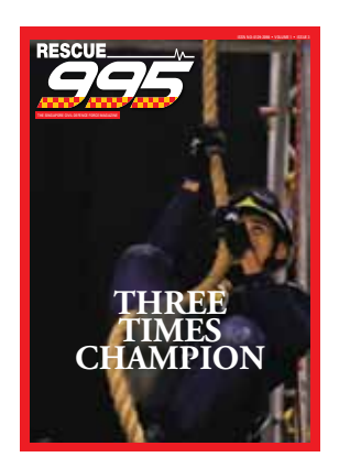
12 SCDF Parade

14 Singapore-Global Firefighters and Paramedics Challenge 2015