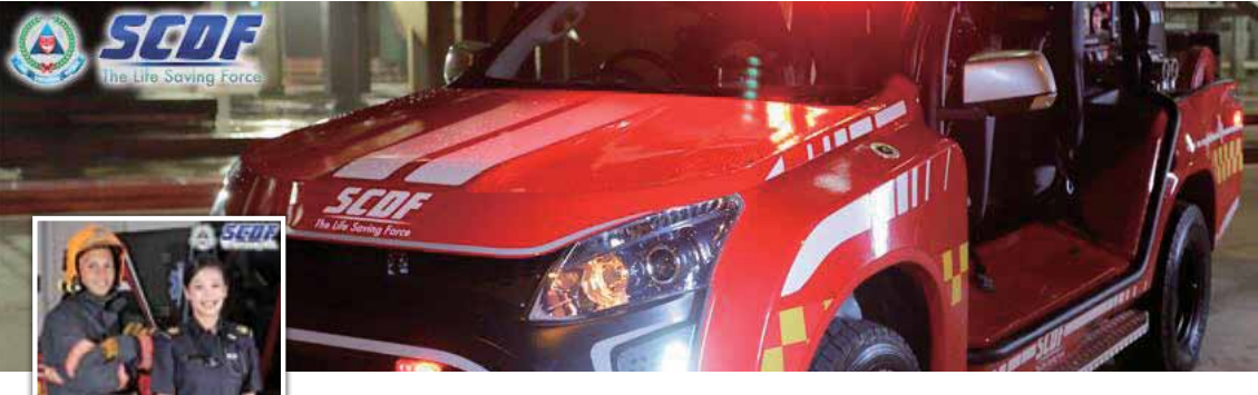
Singapore Civil Defence Force