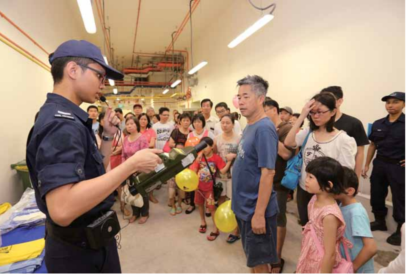
Picture: A SCDF personnel sharing with members of public on the procedures that will take place before anyone can enter the decontamination room of a MRT shelter during an emergency.

the Civil Defence Auxiliary Unit, National Civil Defence Cadet Corps and Civil Defence Lionhearters. At each exhibit, there were also audio-visual presentations on the key features of the MRT shelter and video footage of shelter exercises.